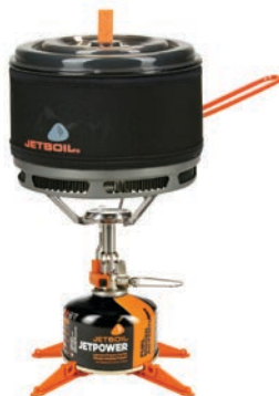
MightyMo is sold separately see page 19