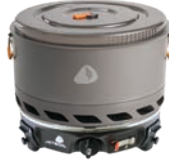
HALFGEN + 5L FLUXRING COOK POT