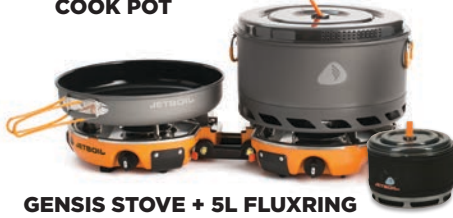
GENESIS STOVE + 5L FLUXRING COOK POT + LUNA + 1.5L CERAMIC FLUXRING COOK POT