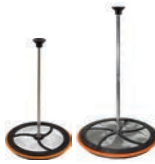
Silicone Coffee Presses