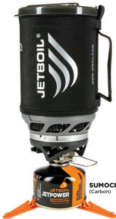
Pot Support Included

Group cooking without sacrificing efficiency.