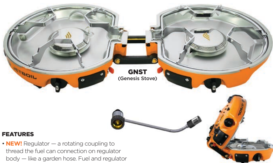
GNST (Genesis Stove)

Adding a compact cook top to your camp kitchen.