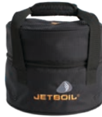
Genesis System Bag