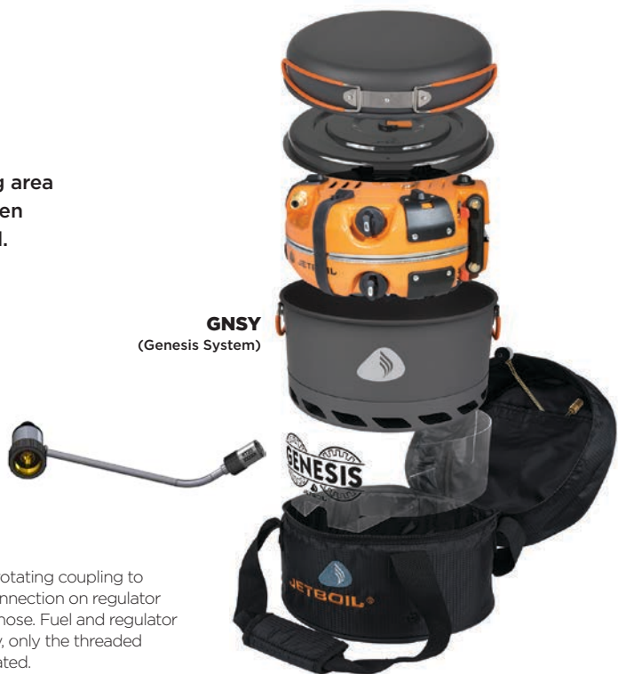
GNSY (Genesis System)

Maximum cooking area and versatility when you're off the grid.