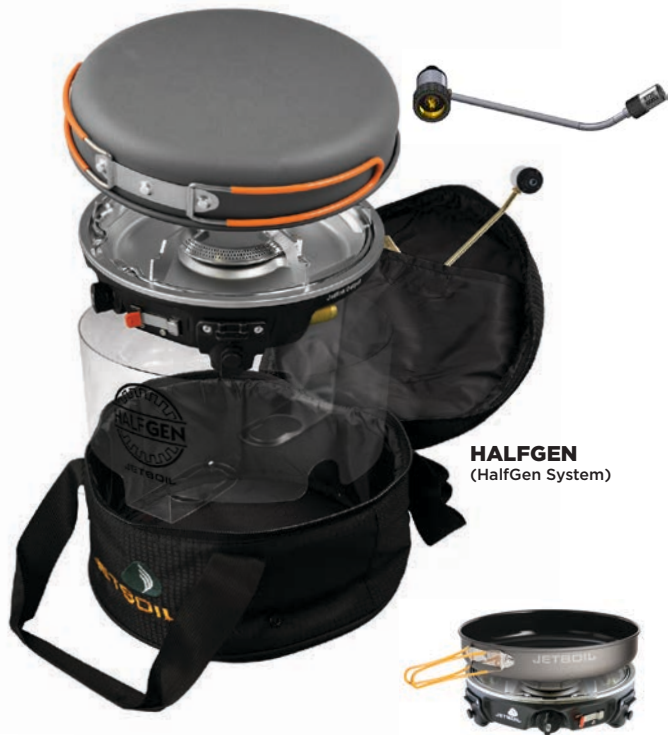
HALFGEN (HalfGen System)

Expanding your basecamp cooking possibilities.