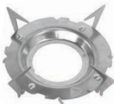
Pot support must be used when cooking on compatible Jetboil systems. (Sold Separately)