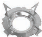
Pot Support Included

Individual cooking and convenient eating — our most popular regulated system.