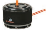
1.5L Ceramic FluxRing Cook Pot